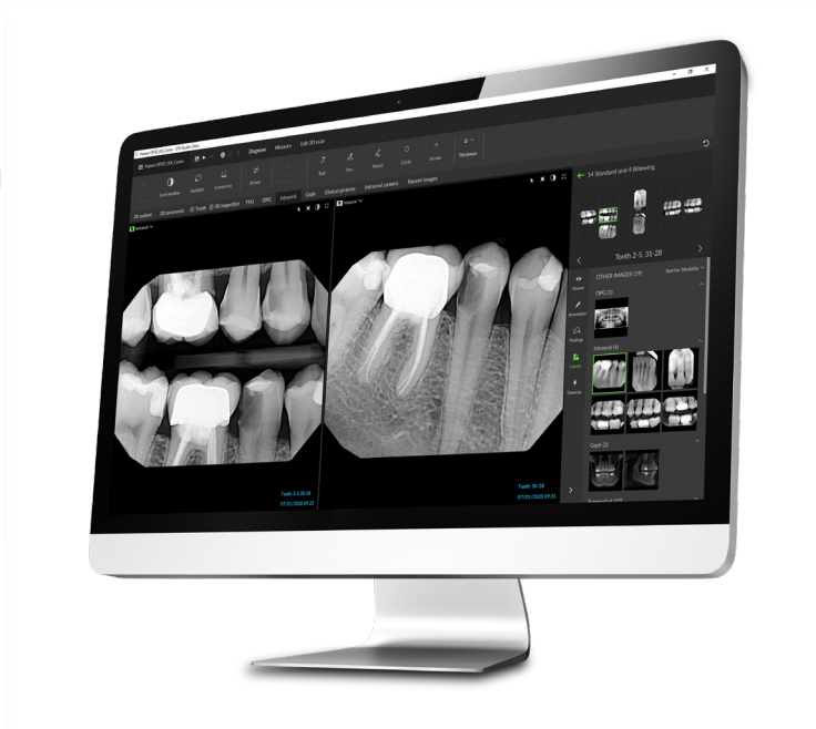
Image quality enhancements.

DEXIS IXS software and any associated updates can be automatically pushed to your computer. No downtime while you update. No need to manage discs or thumb drives. No calling tech support for help. Up-to-date and ready to go, always.